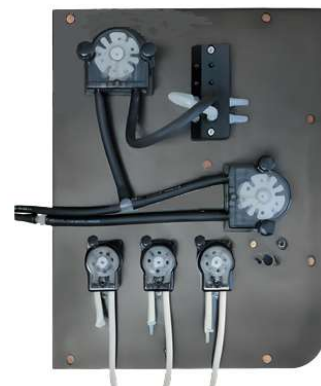
Waltron EasySwap™ Pump Heads