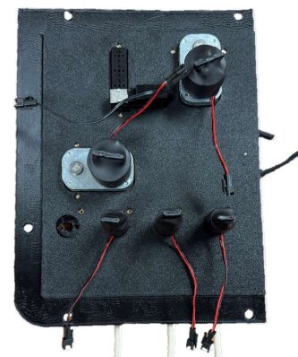
Waltron DuraPro™ Pump Motors

The all-new 3040-Series Wet Section Upgrade is engineered to bring your existing 3040-Series analyzers to the latest design, delivering unparalleled reliability, simplified maintenance, and lower cost of ownership. Designed with the operator in mind, the new compatible 3140-Series Wet Section comes as a preassembled kit with an easy slide-in design for rapid replacement, minimizing future downtime with quick-change, tool-less, EasySwap™ pump heads and tubing maintenance.